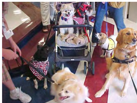
Lebanon VA Hospital Picnic