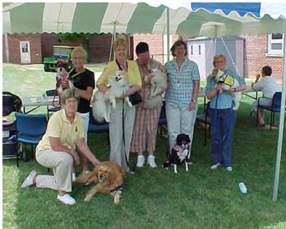
Lebanon VA Hospital Picnic

KPETS was invited to a picnic at Lebanon VA Hospital June 20, 2008. We took our therapy dogs around and mingled with the residents and let them visit with the dogs while they ate lunch. A few of our 4 legged friends got to taste some of the food while the residents slipped them a bite of hot dog or a lick of ice cream. After the residents ate lunch the VA Hospital invited KPETS teams to eat lunch so some of the dogs got another round of food (they didn't seem to mind - the dog's that is)!