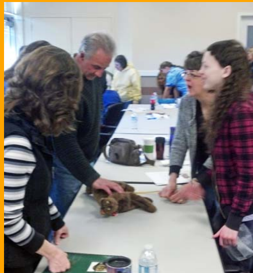
CPR on the kitty.